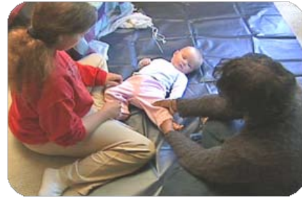
In-Home Family Education visit in Summers County.

In-Home Family Education programs serve families in 22 counties.